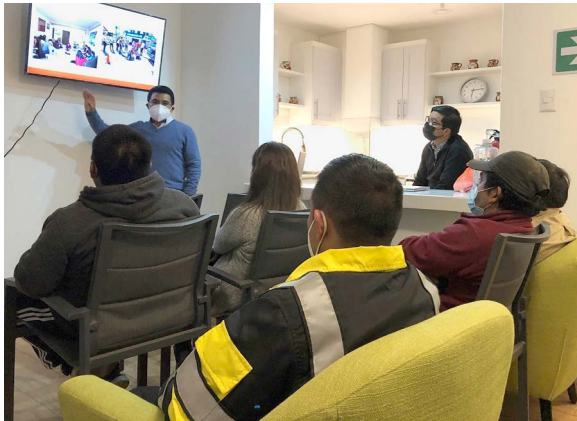
Class for OSSA CPR instructors