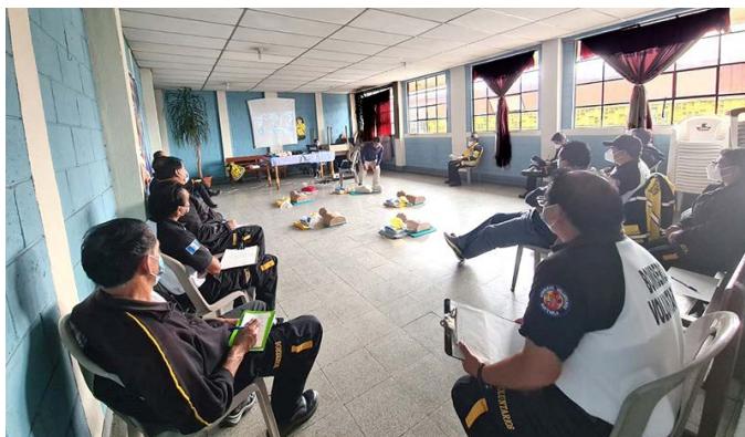
San Marcos firefighters CPR training