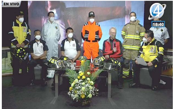
San Marcos Firefighter TV show

OSSA is sponsoring the San Marcos Firefighters weekly TV program that just began November 23, 2021 to educate their community on important activities to protect their lives and homes, as well as describe many of the programs of the Firefighters and OSSA.