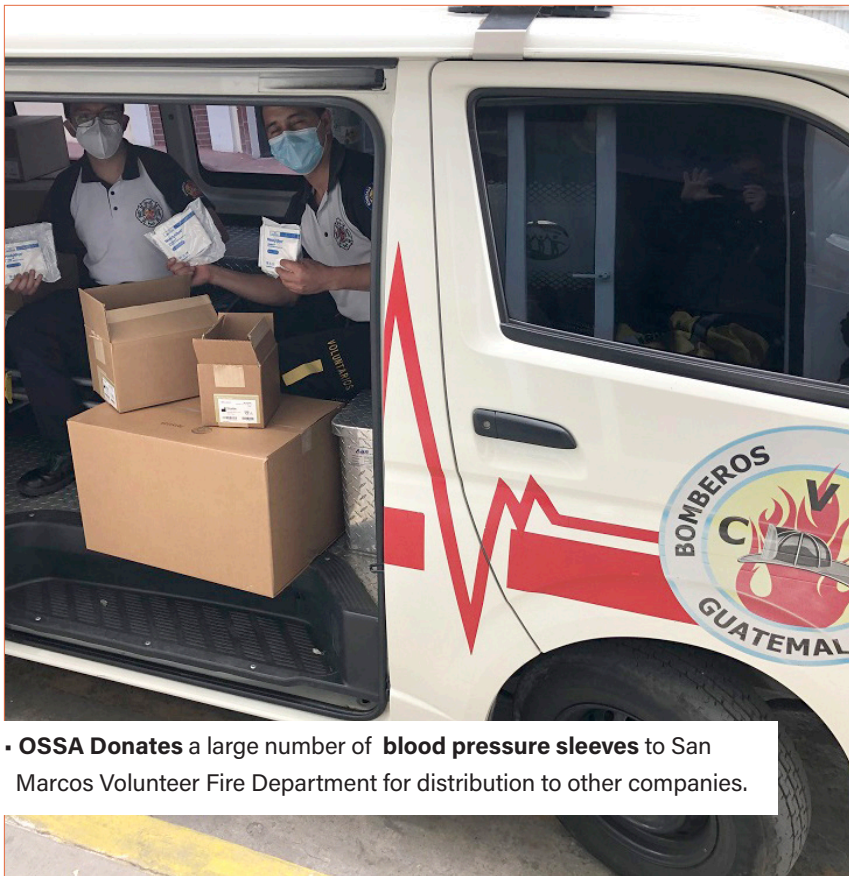
▪ OSSA Donates a large number of blood pressure sleeves to San Marcos Volunteer Fire Department for distribution to other companies.