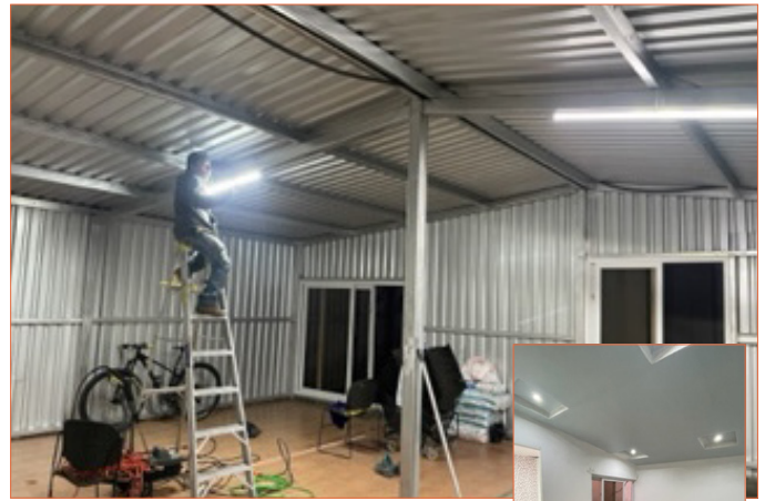
▪ Remodeling of training center facilities for OSSA CEMSE training (Center of Excellence for Medicine, Simulation, and Education).