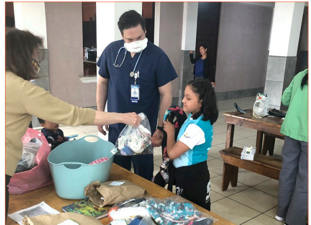
At an orphanage of Canica San Marcos.