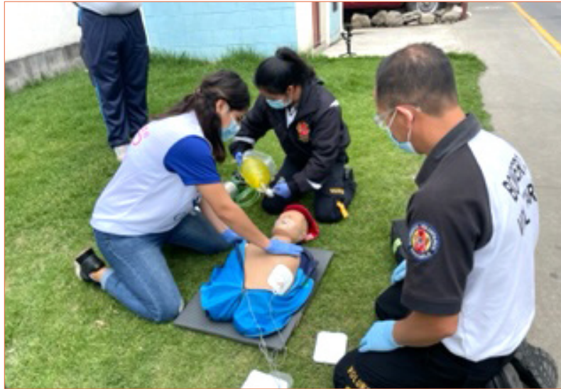
▪ Making videos about CPR and first aid with the support of volunteer firefighters of San Marcos.