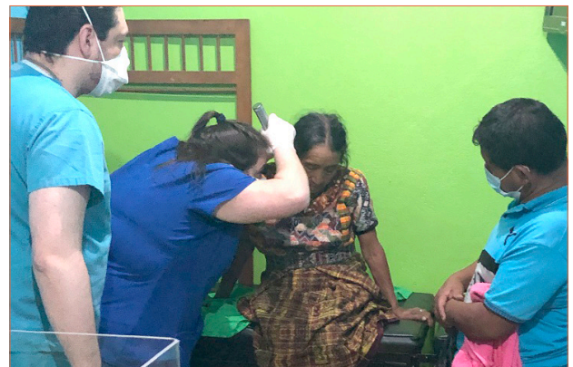
At the private clinic in Comitancillo.