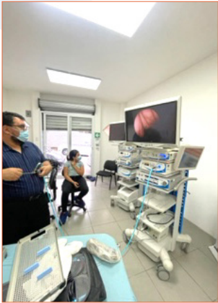
▪ Review of video surgery equipment in OSSA facilities.