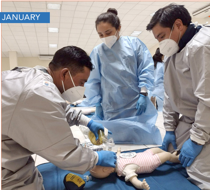
First CPR course for APROFAM staff and COVID 19 nurses National Hospital of San Marcos taught by OSSA Guatemala team.